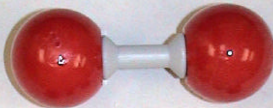
Oxygen ( \text{O}_2 )