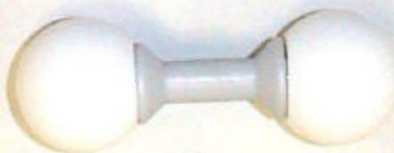
Hydrogen ( \text{H}_2 )